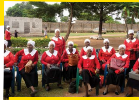
Members of the Women's Christian Fellowship about to leave to preach in a rural area.