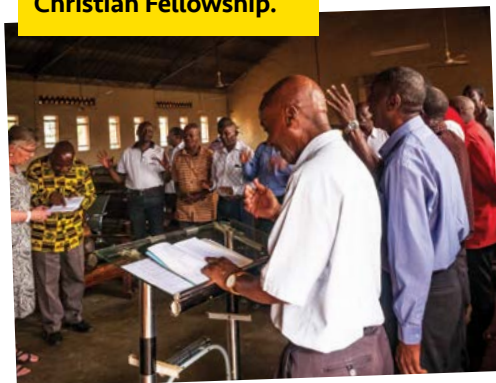
Taking part in the Men's Christian Fellowship.