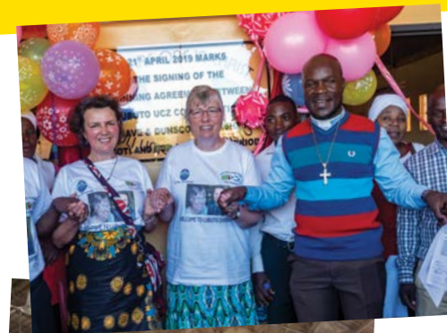
The service to renew our twinning after 10 years.