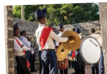
Boys Brigade practising (using instruments donated by our churches).