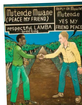
What the twinning means to me - (in Bemba our twinning motto is Tuli Umo Muli Christu - we are one in Christ).